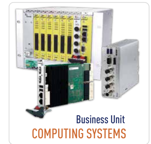
Business Unit COMPUTING SYSTEMS

duagon offers a robust range of embedded COTS boards and devices widely used in extreme environmental conditions found in mobile, industrial and safety-critical applications.