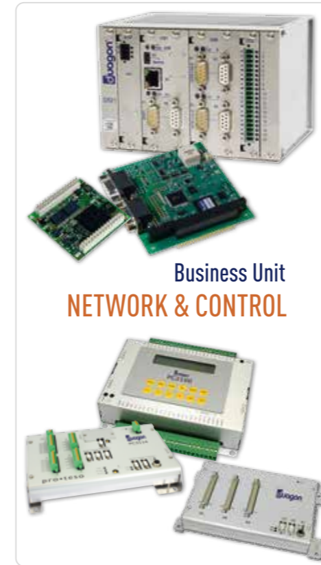
Business Unit NETWORK & CONTROL